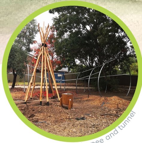
Teepee and tunnel