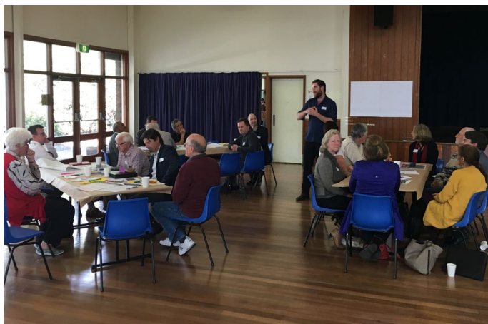
Community and stakeholder workshop session