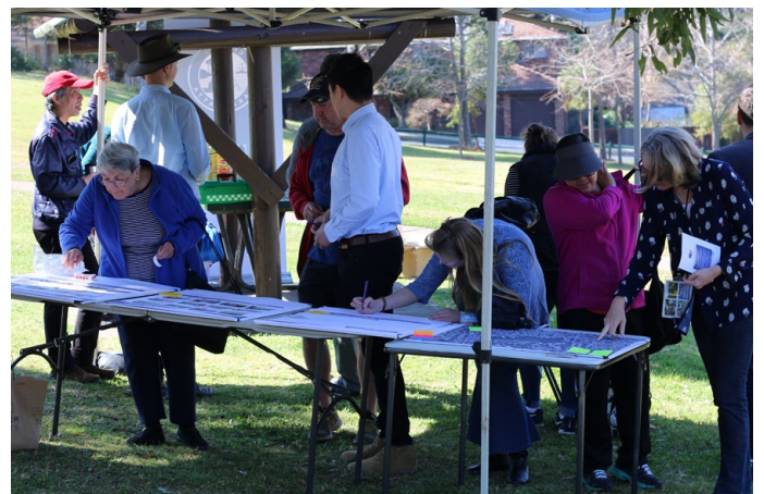
Community drop-in session