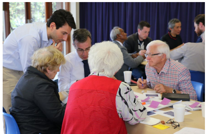
Community and stakeholder workshop session