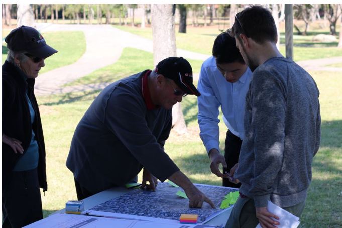
Community drop-in session