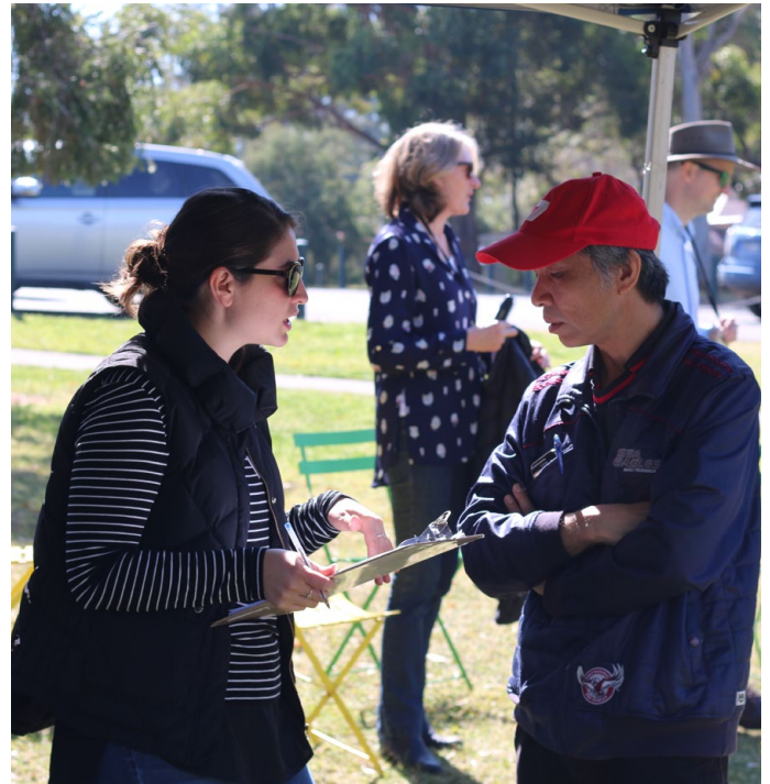
Intercept surveys with local residents in John Wearn Reserve

The Master Plan will review and make recommendations for improvements to community facilities; existing building use, condition and placement; parkland; sportsfields; and park amenities and recreation facilities.