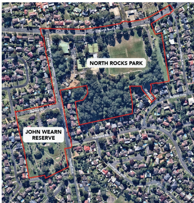
North Rocks Park Precinct site boundary

John Wearn Reserve comprises 2.4ha of land located on the corner of Farnell Ave and Balaka Drive, Carlingford. John Wearn has a wide range of facilities catering for all ages. It is a key passive recreational area containing BBQ and picnic areas, circuit bike/walking tracks, an enclosed playground, basketball/netball practice hoops, a covered stage and the Council operated North Rocks Child Care Centre.