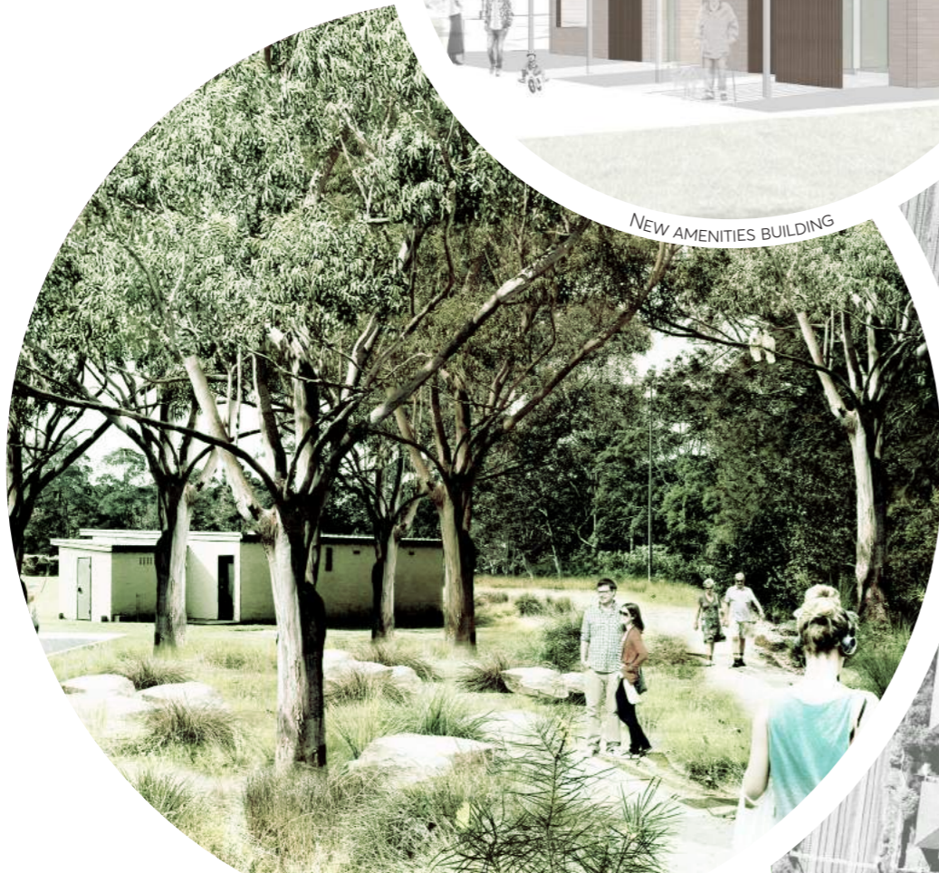
MASS TREE PLANTING TO BLAXLAND ROAD FRONTAGE