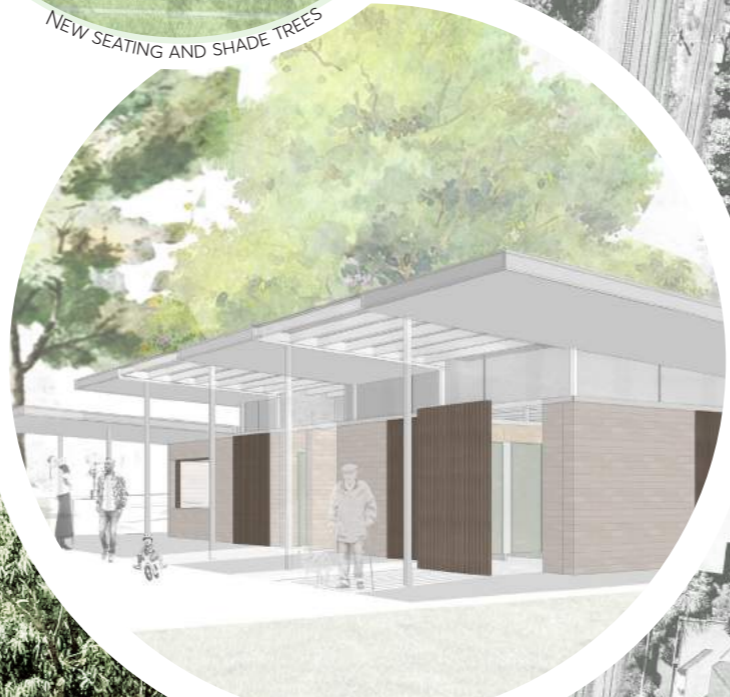
NEW AMENITIES BUILDING