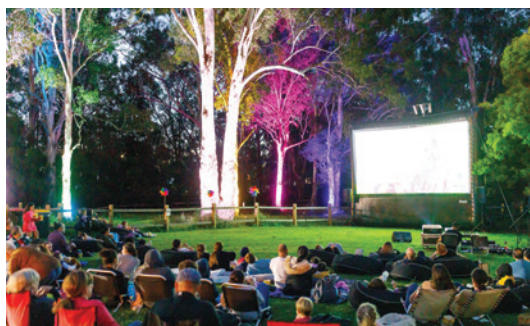
Cinema night at Gallery Gardens

Visit our new Gallery Garden Park and tell us your thoughts by scanning the QR code below.