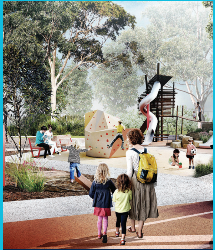
Artist's impression of the new Arthur Phillip Park district playground