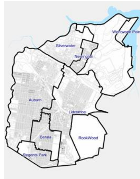
Map 2: Silverwater / Homebush Bay Area and Carter Street Precinct