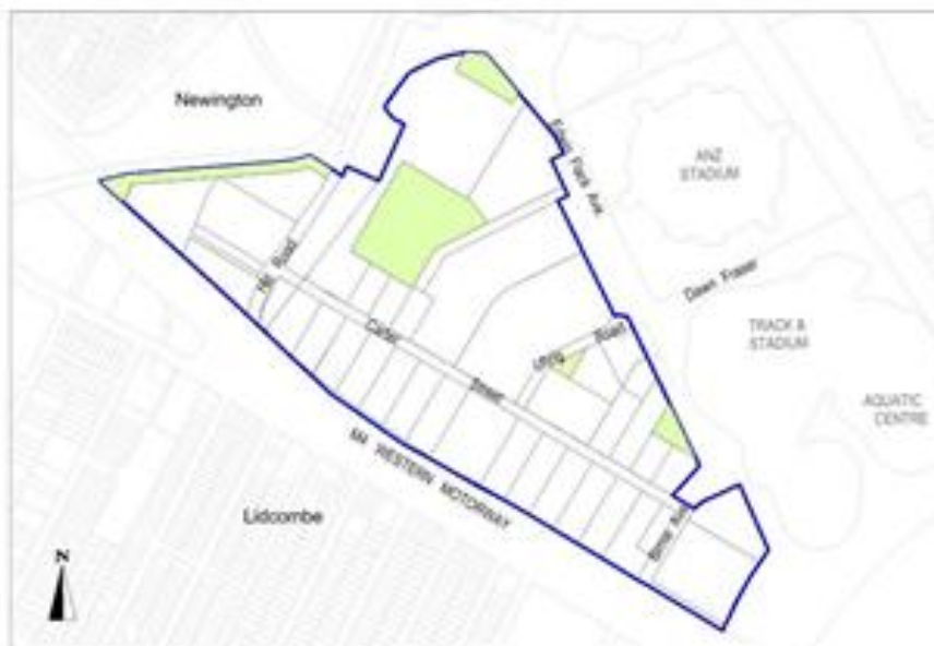
Figure 1 Land to which Plan applies

All remaining funds collected under Part D of the Auburn Development Contributions Plan 2007 are to be applied toward completing the Schedule 4 Works Program in this plan.