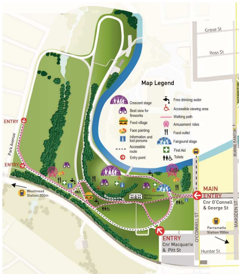
Map 1: NYE 2016, Parramatta Park

Crowd Attendance: 60,000 in attendance for the fireworks spectacular.