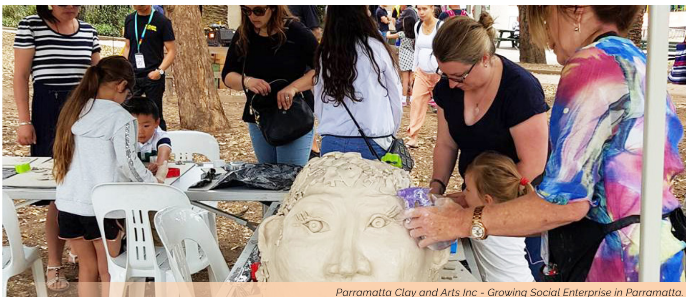
Parramatta Clay and Arts Inc - Growing Social Enterprise in Parramatta.