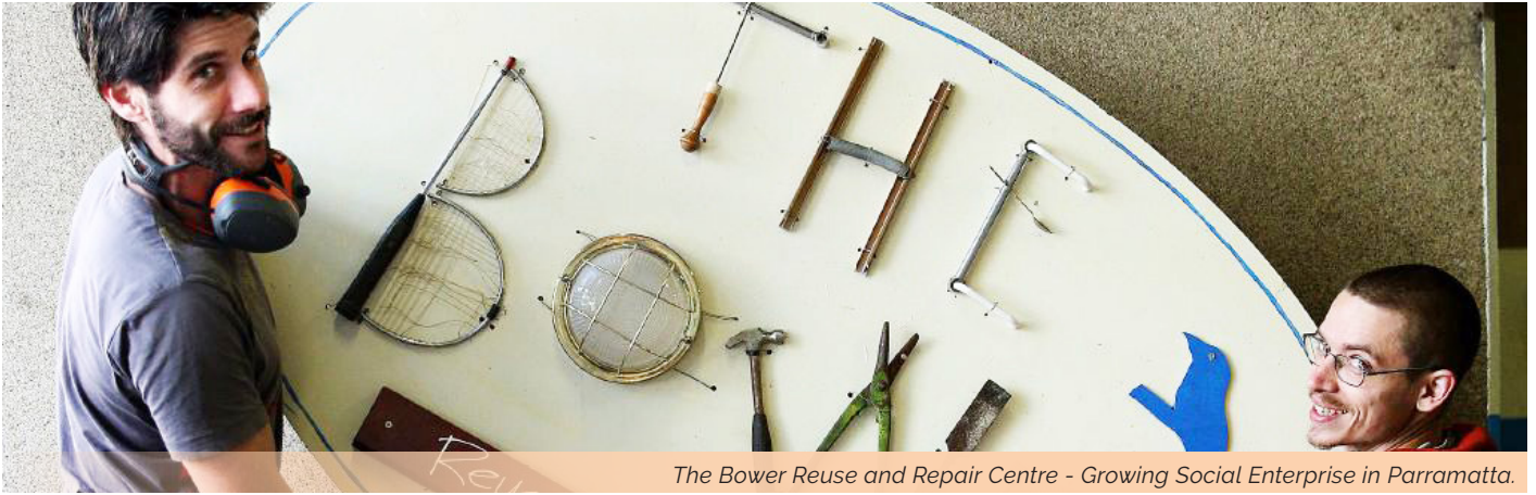
The Bower Reuse and Repair Centre - Growing Social Enterprise in Parramatta.