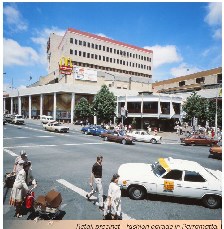
Retail precinct - fashion parade in Parramatta.

Failure to acquit the grant will affect any future funding requests.