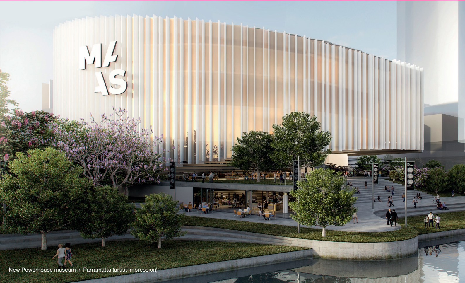
New Powerhouse museum in Parramatta (artist impression)

The new Powerhouse museum in Parramatta will be bigger and better than anything that NSW has ever seen and will rival global icons such as the London Science Museum and the Smithsonian Air and Space Museum.