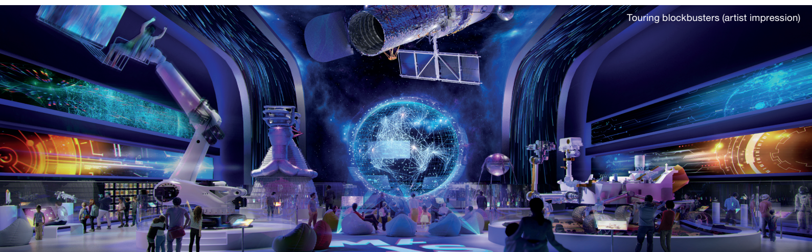
Touring blockbusters (artist impression)