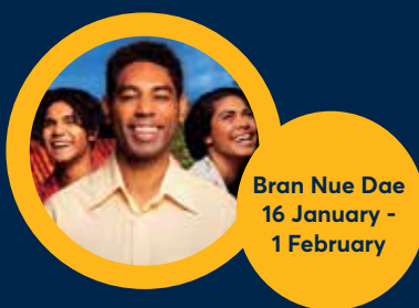
Bran Nue Dae 16 January - 1 February