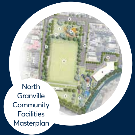
North Granville Community Facilities Masterplan