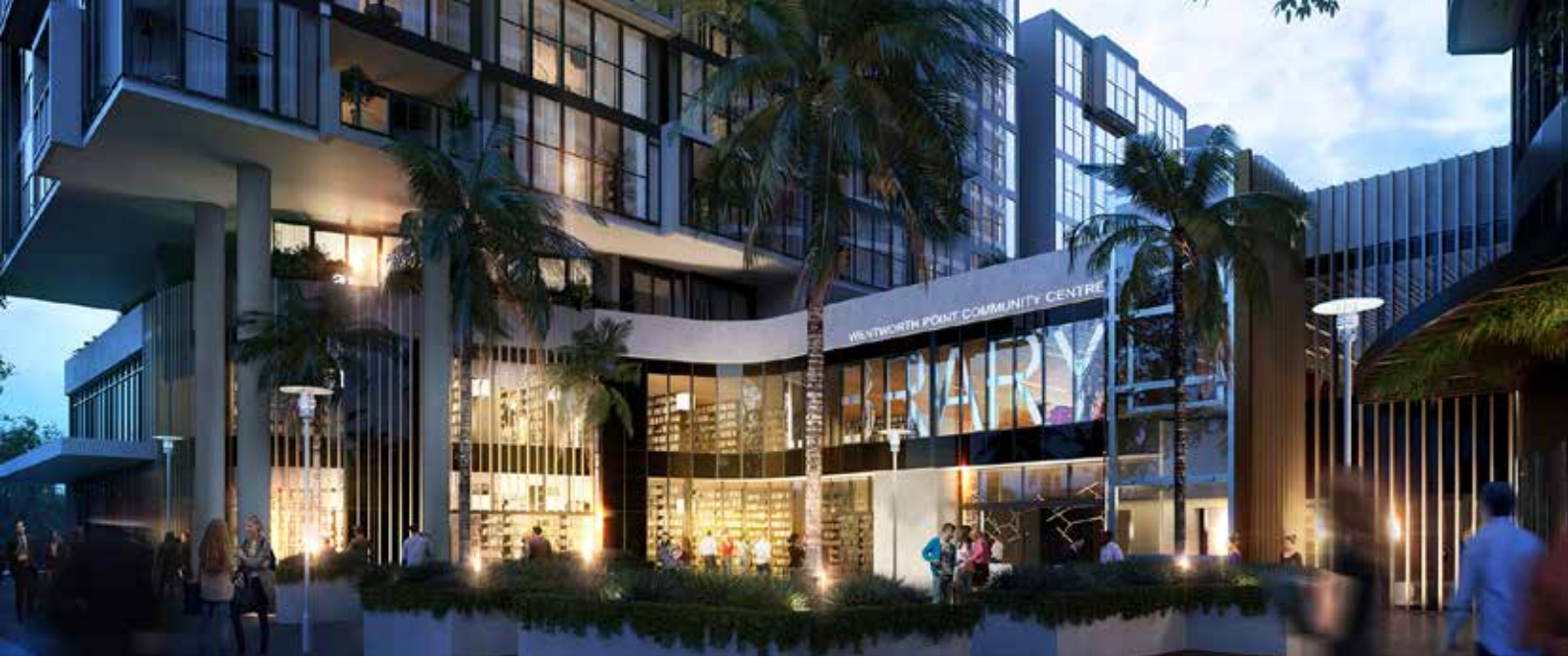
Artist's impression of the new Wentworth Point Community Centre and Library.