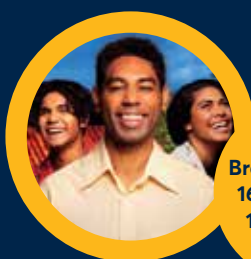
Bran Nue Dae 16 January - 1 February

The world's best-loved Aboriginal stage musical, Bran Nue Dae , gets a major revival on its 30th birthday – starring Ernie Dingo. The home-grown music classic by Jimmy Chi and Kuckles is packed with humour, song and hope.