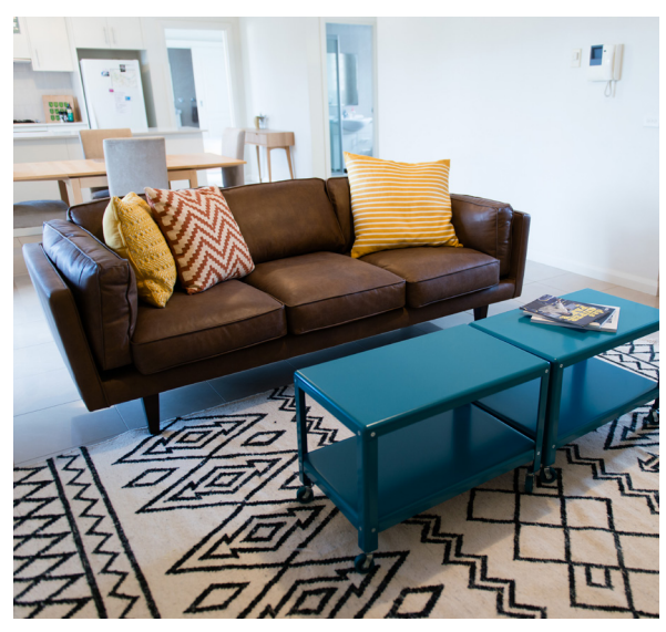
AIR Residential Apartment, lounge area.