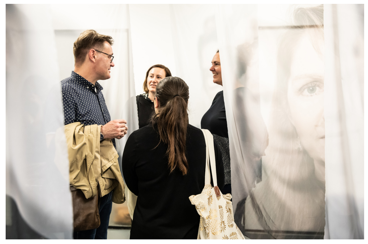
Eat Talk Dance, 2019.