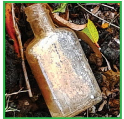
Tooths branded bottle found during May 2019 soil investigations.