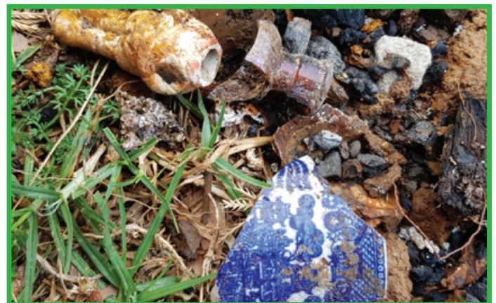
Broken glass and ceramics found during May 2019 soil investigations.

As a safety measure, these areas are fenced and will remain closed to the public until remediation works and construction are completed.