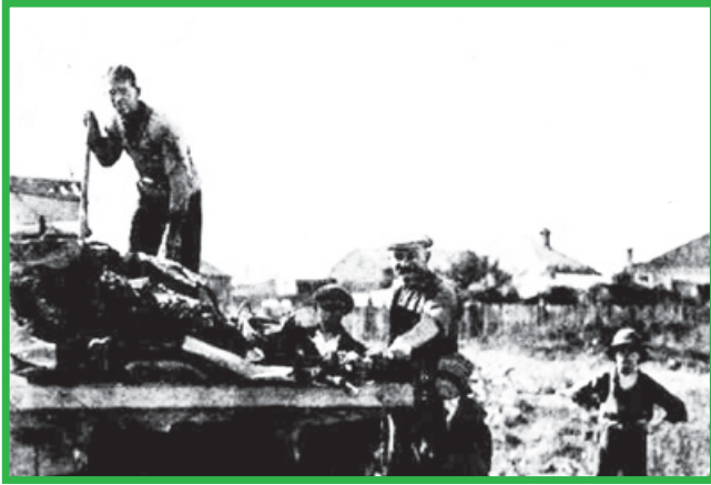
City of Parramatta archive photo of old Granville Landfill