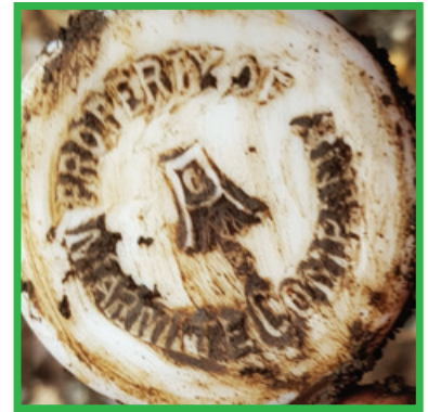
Marmite jar found during May 2019 soil investigations.

For more information visit: oursay.org/cityofparramatta/northgranville