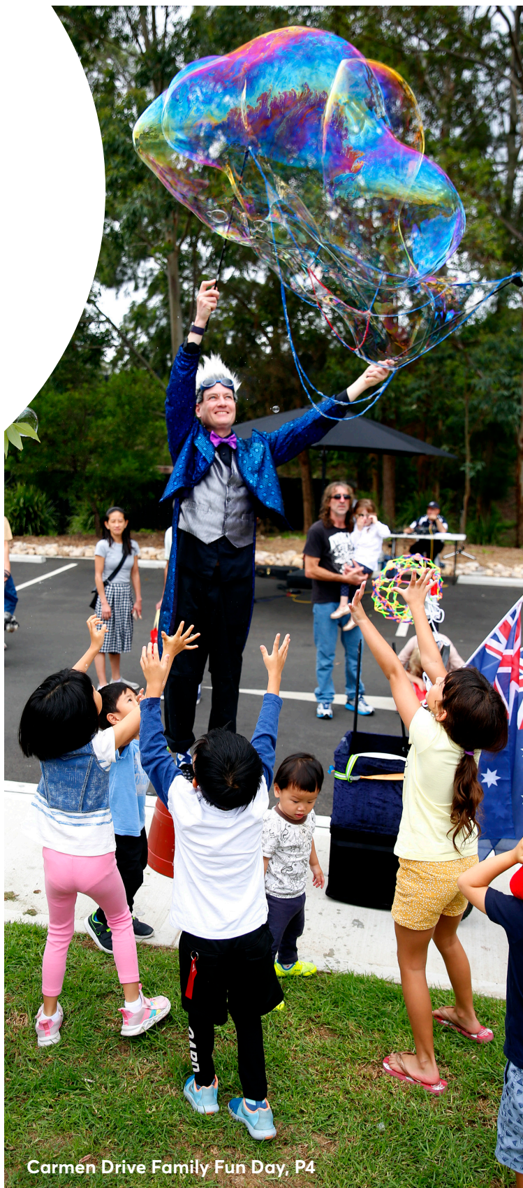
Carmen Drive Family Fun Day, P4