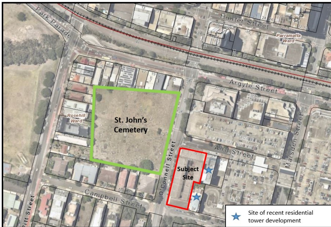
Figure 1: Site location