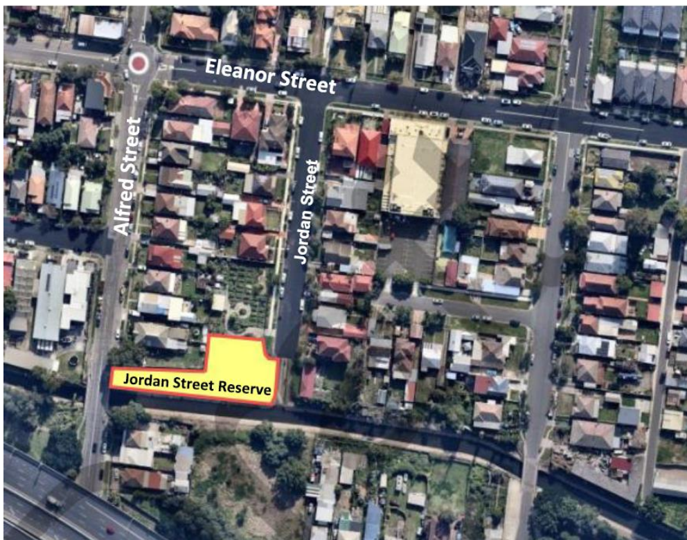
Image 2: Yellow shaded area indicating closed sections of Jordan Street Reserve, Rosehill

Areas where contaminated materials were present beneath the soil were closed as a precautionary measure. These areas were fenced to limit soil disturbance, prevent public access and possible physical contact with any potential contaminants that pose a contact risk ( see closed areas in map below).