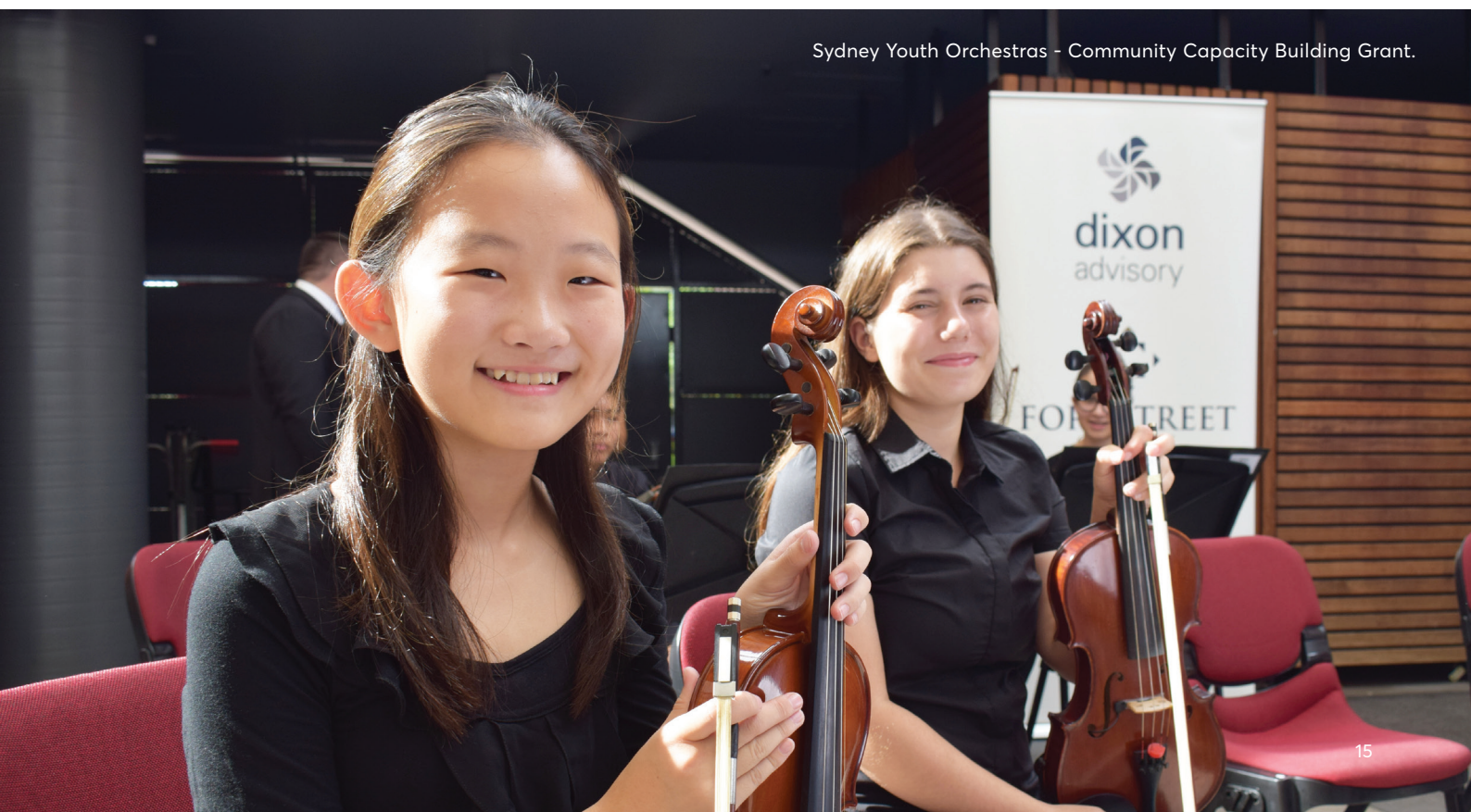
Sydney Youth Orchestras - Community Capacity Building Grant.