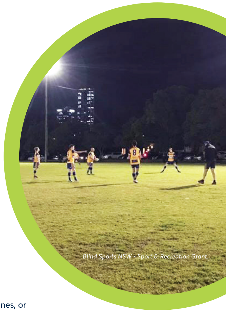
Blind Sports NSW - Sport & Recreation Grant.

If you need assistance in understanding these Guidelines, or have any questions, please contact the Community Capacity Building Team on 9806 5110 or email grants@cityofparramatta.nsw.gov.au .