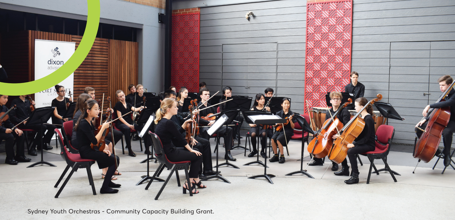
Sydney Youth Orchestras - Community Capacity Building Grant.