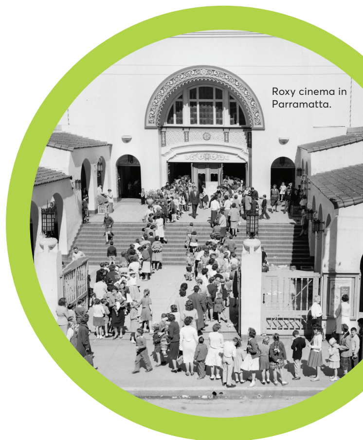
Roxy cinema in Parramatta.

Any applications related to Aboriginal Culture will be required to consult with Council's Aboriginal and Torres Strait Islander Advisory Committee. For details about the advisory committee, please contact the Community Capacity Building Team on 9806 5110 .