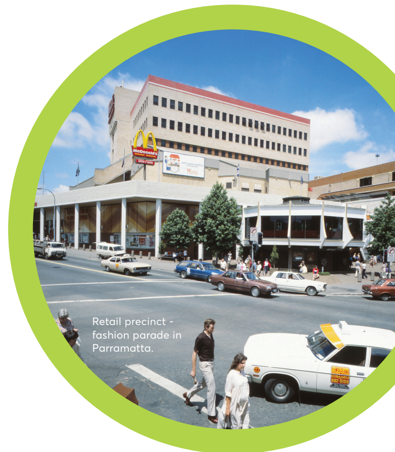
Retail precinct - fashion parade in Parramatta.

Failure to acquit the grant will affect any future funding requests.