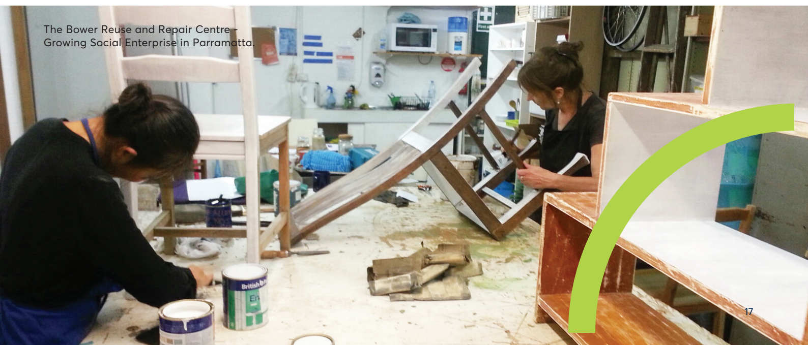
The Bower Reuse and Repair Centre – Growing Social Enterprise in Parramatta.