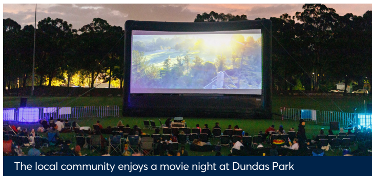
The local community enjoys a movie night at Dundas Park

You can find further information about these projects and many others throughout this newsletter.