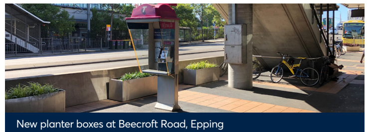
New planter boxes at Beecroft Road, Epping

The planter boxes outside Epping Hotel and at the bottom of the stairs from Epping Station along Beecroft Road are being refreshed with new plantings at a cost of $2,000.