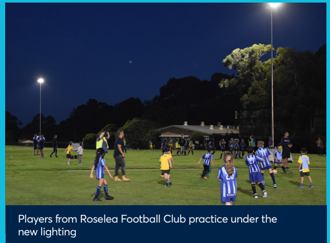
Players from Roselea Football Club practice under the new lighting