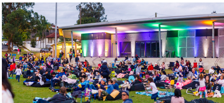
Alan Hayes Pavilion

To celebrate the official opening of Alan Hayes Pavilion at Dundas Park, 600 people gathered at an outdoor cinema event on 16 April. The festive crowd watched the family-friendly movie Pokémon Detective Pikachu. A small entry fee of $5 provided movie goers with a sausage sizzle, drink and popcorn to enjoy with their movie.