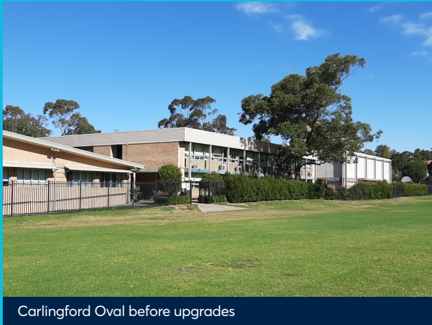
Carlingford Oval before upgrades

The project has been a collaborative effort between Roselea Football Club and City of Parramatta, with input and support from Carlingford High School and the NSW Department of Education and Training.