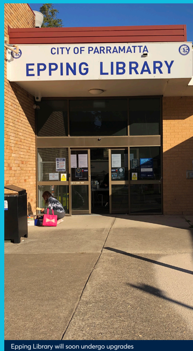
Epping Library will soon undergo upgrades

The project is in the design phase, with construction scheduled to start in August. The upgrades are expected to be completed by February 2022. Council will endeavour to minimise impacts on library users, particularly during the HSC period later this year.