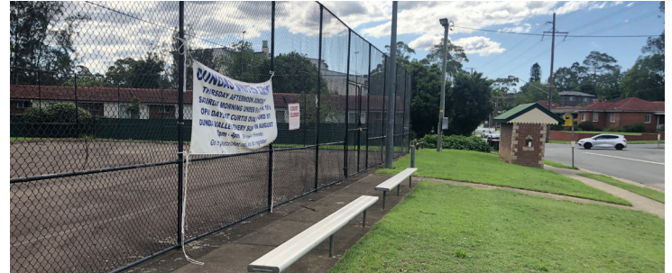
Yates Avenue netball court in Dundas Park

You can play netball, basketball, or even a casual game of badminton or handball there. Whilst there, why not pick up a book from the street library outside the court? You can enjoy reading it in the picnic shelter next to the court.