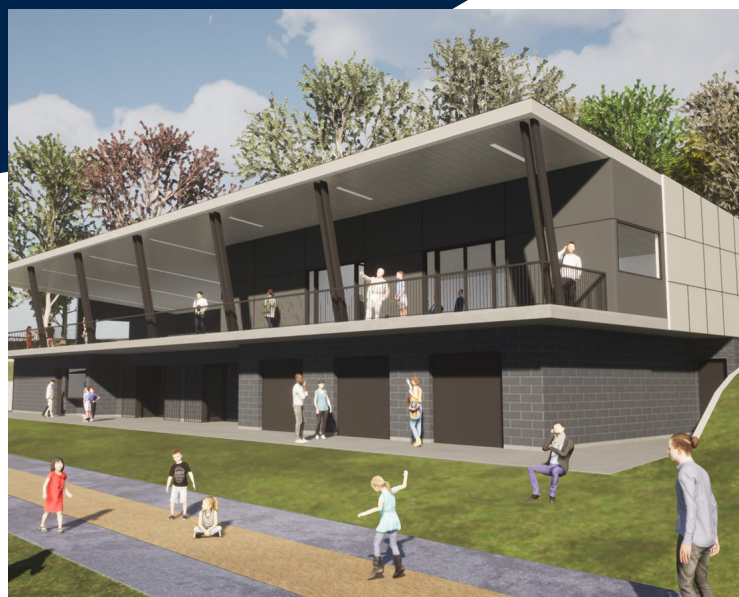
Artist's impression of Peggy Womersley Amenities Building