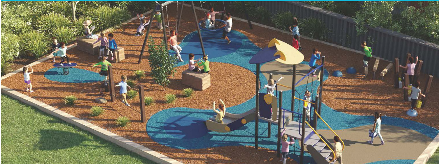
Artist's impression of Melbourne Road Reserve

Melbourne Road Reserve is classified as a 'Pocket Park' so the available budget is limited to the playground area only and does not cover additional park enhancements.