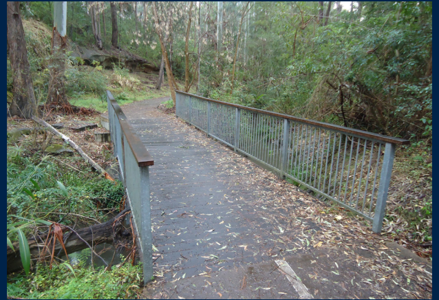
The Hunts Creek Pedestrian Bridge and Walking Track

Northam Drive Reserve is getting a new bridge and walking track. Construction of Hunts Creek Pedestrian Bridge and Walking Track will commence in mid-2021.