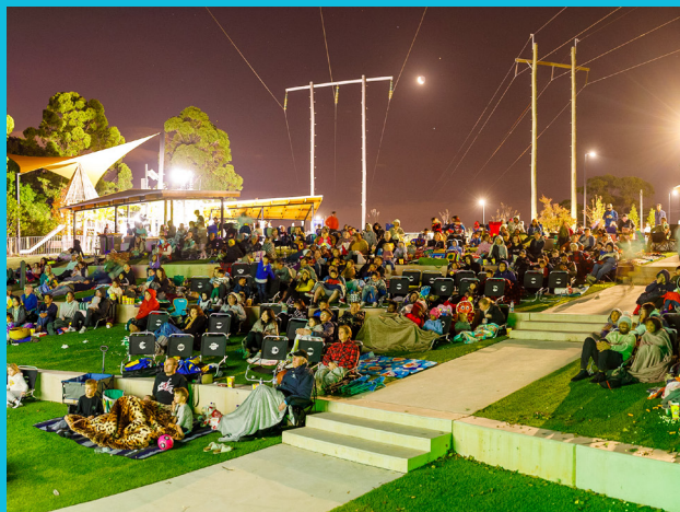
John Wearn Reserve Family Fun Day Movie Night

Outdoor areas play an important role in our community's health, wellbeing and prosperity, so it's important that these spaces meet the needs of our growing population. Council is committed to upgrading our parks and playgrounds to ensure the community has access to first-class facilities that are close to home, right across our Local Government Area.