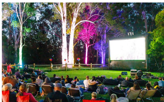
Cinema night at Gallery Gardens

Visit our new Gallery Garden Park and tell us your thoughts by scanning the QR code below.