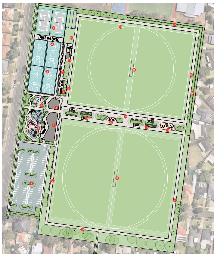
Draft Binalong Park Masterplan Map