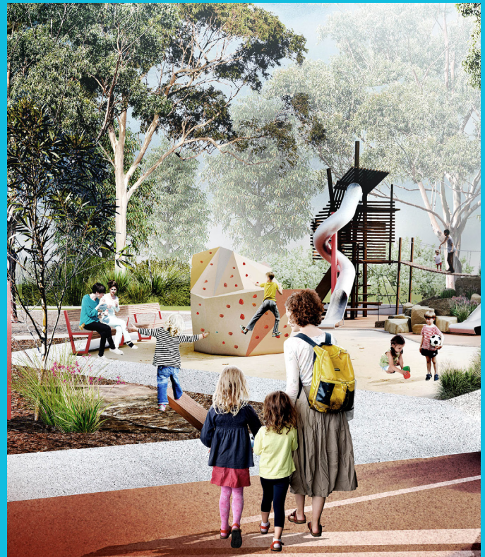
Artist's impression of the new Arthur Phillip Park district playground