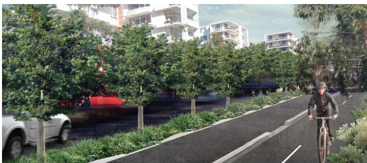
Artist's impression of a separated cycleway

Alfred Street is a key route connecting Granville to the Parramatta CBD. Council is upgrading Alfred Street to support a separated cycleway. The concept design was adopted by Council late 2020. Detailed design is almost complete. Construction of Stage 1 of the cycleway (Eleanor Street to Gray Street) and improved street scape is estimated to begin June/July 2021.