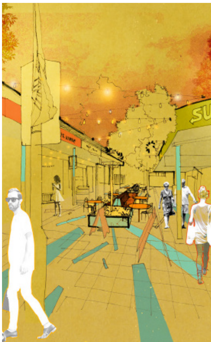
Ermington Laneway Activation artist's impression

This project includes footpath artwork, lighting design, garden beds and new street furniture at the (Betty Cuthbert) Ermington Shopping Town to help to increase activation of an already very popular set of local shops. These works will help to increase patronage, creating a space where people will want to sit and linger for longer. The proposed catenary lighting will be visible from the roadway, boosting potential for a night-time economy and night time dining opportunities. The design for these works is currently underway.