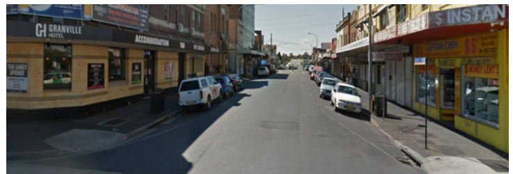
Improvements are underway on Good and Bridge streets