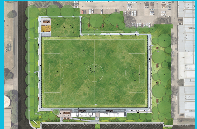
Newington Reserve Concept Plan

City of Parramatta Council is upgrading Newington Reserve on the corner of Slough Avenue and Holker Street in Silverwater. The $7.5 million project will deliver a new recreational facility, including a full-size synthetic grass football (soccer) field, lighting, mini synthetic football field, a sports pavilion building, spectator seating, park furniture, electric barbecues, and outdoor exercise equipment. Garden beds and new trees are also planned, along with on-street carparking (subject to approvals).