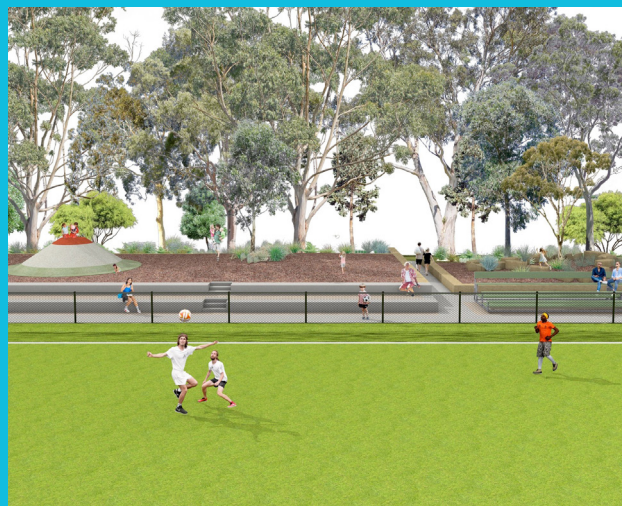
Rydalmere Park Stage 2 artist's impression