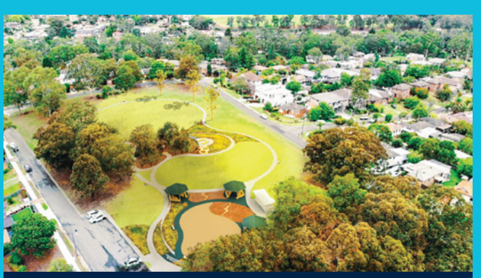
Artist's impression of Acacia Park

establish before the park reopens to the public. The upgrades at both parks are being funded by a $5 million grant as part of the NSW Government's Precinct Support Scheme.