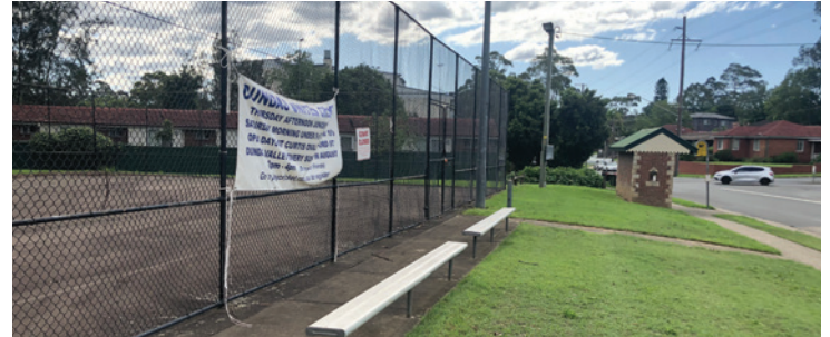
Yates Avenue netball court in Dundas Park

You can play netball, basketball, or even a casual game of badminton or handball there. Whilst there, why not pick up a book from the street library outside the court? You can enjoy reading it in the picnic shelter next to the court.