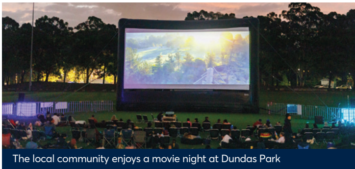
The local community enjoys a movie night at Dundas Park

You can find further information about these projects and many others throughout this newsletter.