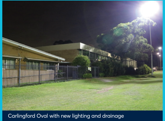
Carlingford Oval with new lighting and drainage