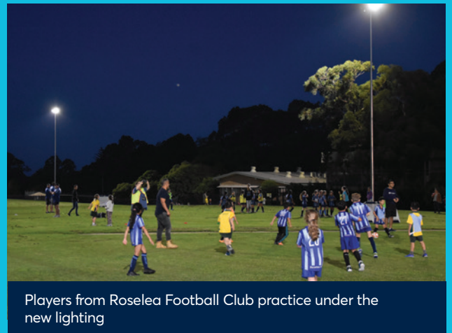
Players from Roselea Football Club practice under the new lighting