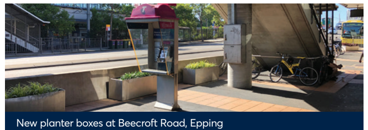
New planter boxes at Beecroft Road, Epping

The planter boxes outside Epping Hotel and at the bottom of the stairs from Epping Station along Beecroft Road are being refreshed with new plantings at a cost of $2,000.