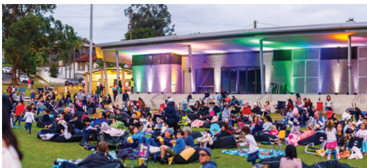
Alan Hayes Pavilion

To celebrate the official opening of Alan Hayes Pavilion at Dundas Park, 600 people gathered at an outdoor cinema event on 16 April. The festive crowd watched the family-friendly movie Pokémon Detective Pikachu. A small entry fee of $5 provided movie goers with a sausage sizzle, drink and popcorn to enjoy with their movie.