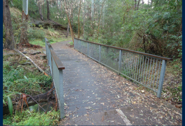
The Hunts Creek Pedestrian Bridge and Walking Track

Northam Drive Reserve is getting a new bridge and walking track. Construction of Hunts Creek Pedestrian Bridge and Walking Track will commence in mid-2021.