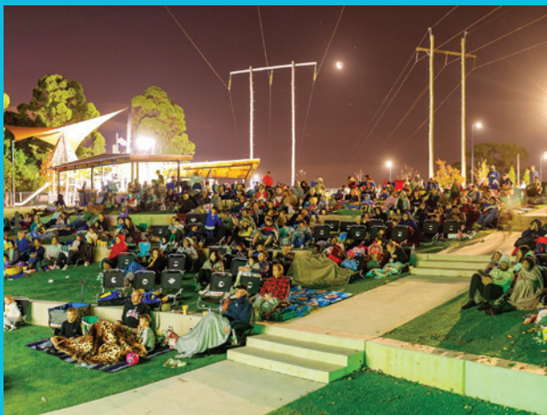
John Wearn Reserve Family Fun Day Movie Night

Outdoor areas play an important role in our community's health, wellbeing and prosperity, so it's important that these spaces meet the needs of our growing population. Council is committed to upgrading our parks and playgrounds to ensure the community has access to first-class facilities that are close to home, right across our Local Government Area.