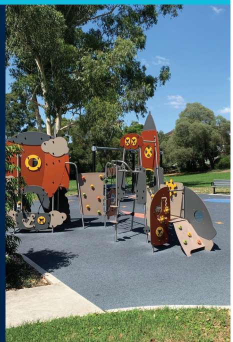
Playground at Burnside Gollan Reserve

People will be able to enjoy the park and playground more.