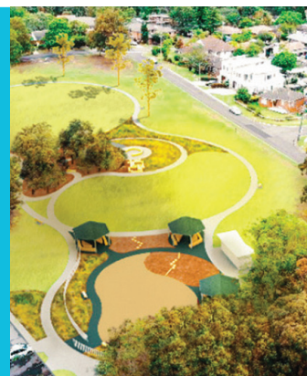
Picture of Acacia Park

There will be new barbecues, sport courts and playgrounds.