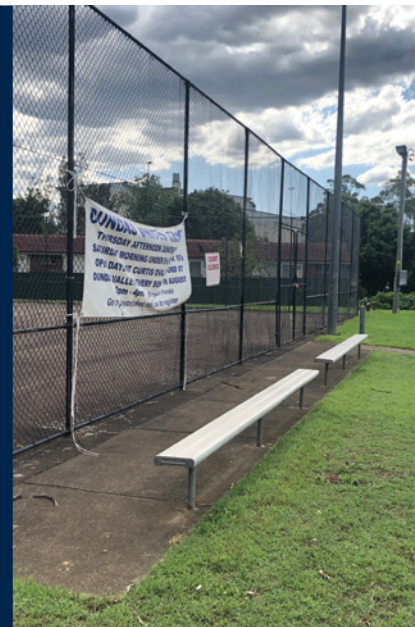
Netball court at Yates Avenue in Dundas Park

It is also easier to find the toilet blocks.