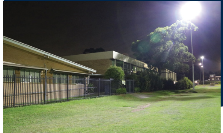
Carlingford Oval with new lights and drains