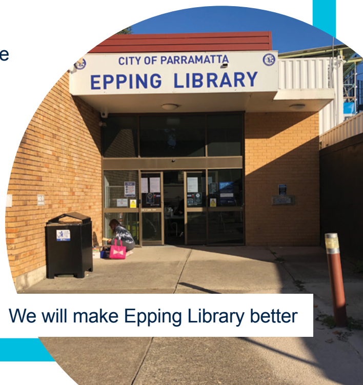
We will make Epping Library better