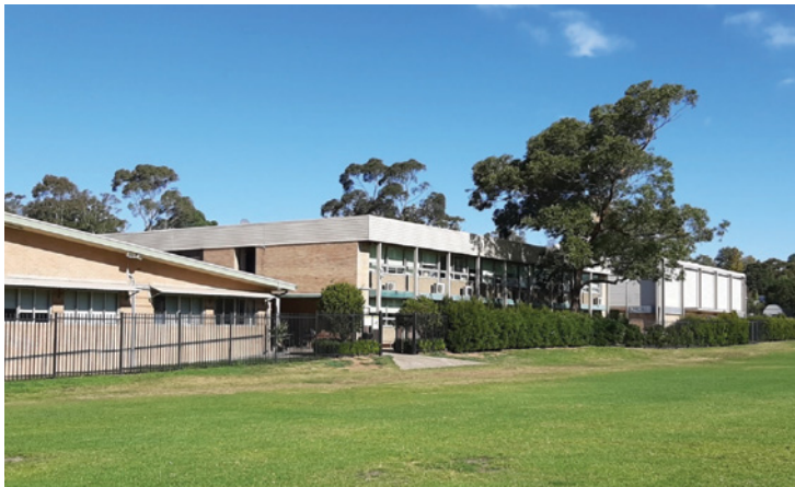
Carlingford Oval before the changes

We got some ideas from Carlingford High School and the NSW Department of Education and Training.