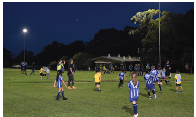
Players from Roselea Football Club practice under the new lights