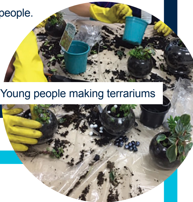
Young people making terrariums

They also made terrariums which are glasses with plants inside.