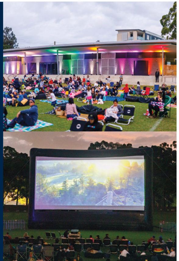
People from the community watching a movie at Dundas Park