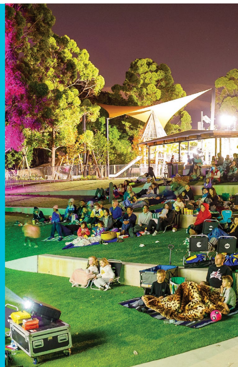
Movie night at John Wearn Reserve