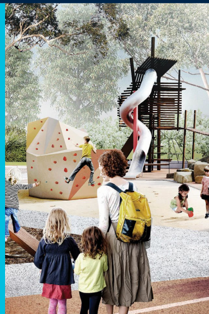
Drawing of the new Arthur Phillip Park.

For more information send an email to placeservices@cityofparramatta.nsw.gov.au