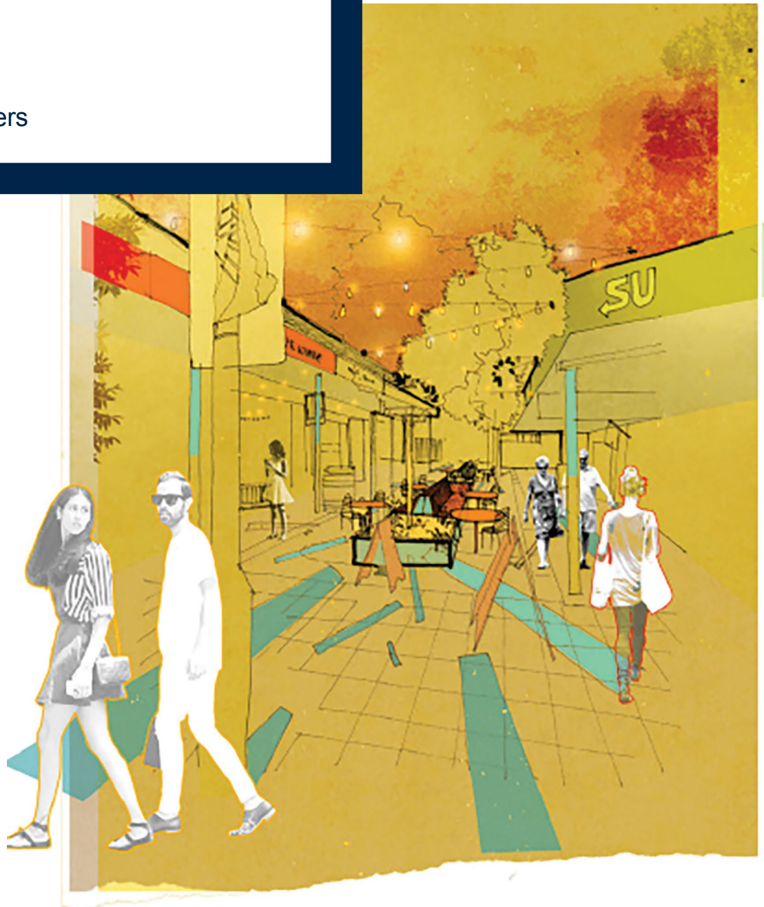
Drawing of changes to Ermington Laneway