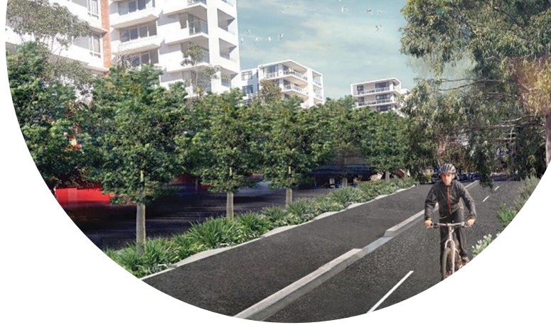
A drawing of the bike path

cityofparramatta.nsw.gov.au/family-fun-day-program