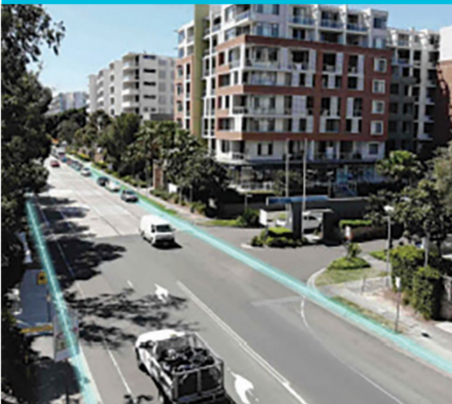
Part of Hill Road Plan

We will also paint the lines on the road to make them brighter.