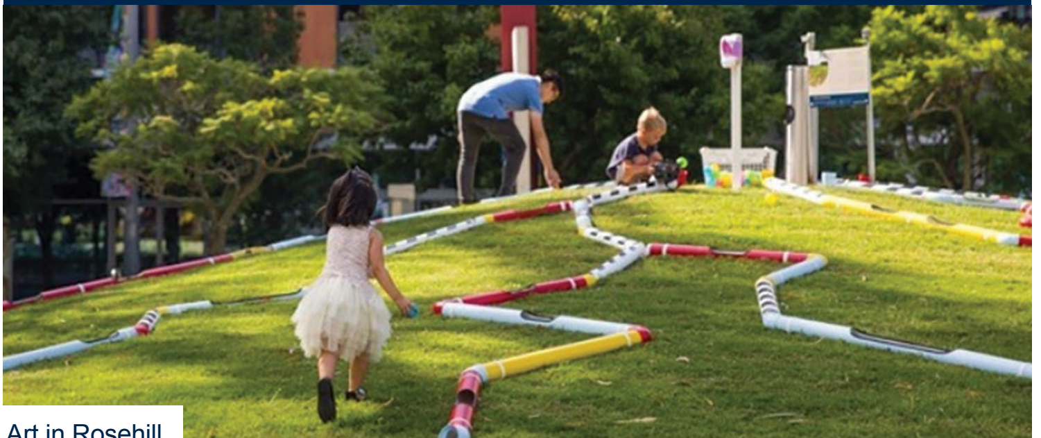
Art in Rosehill

The art was part of a program to make public areas nice.