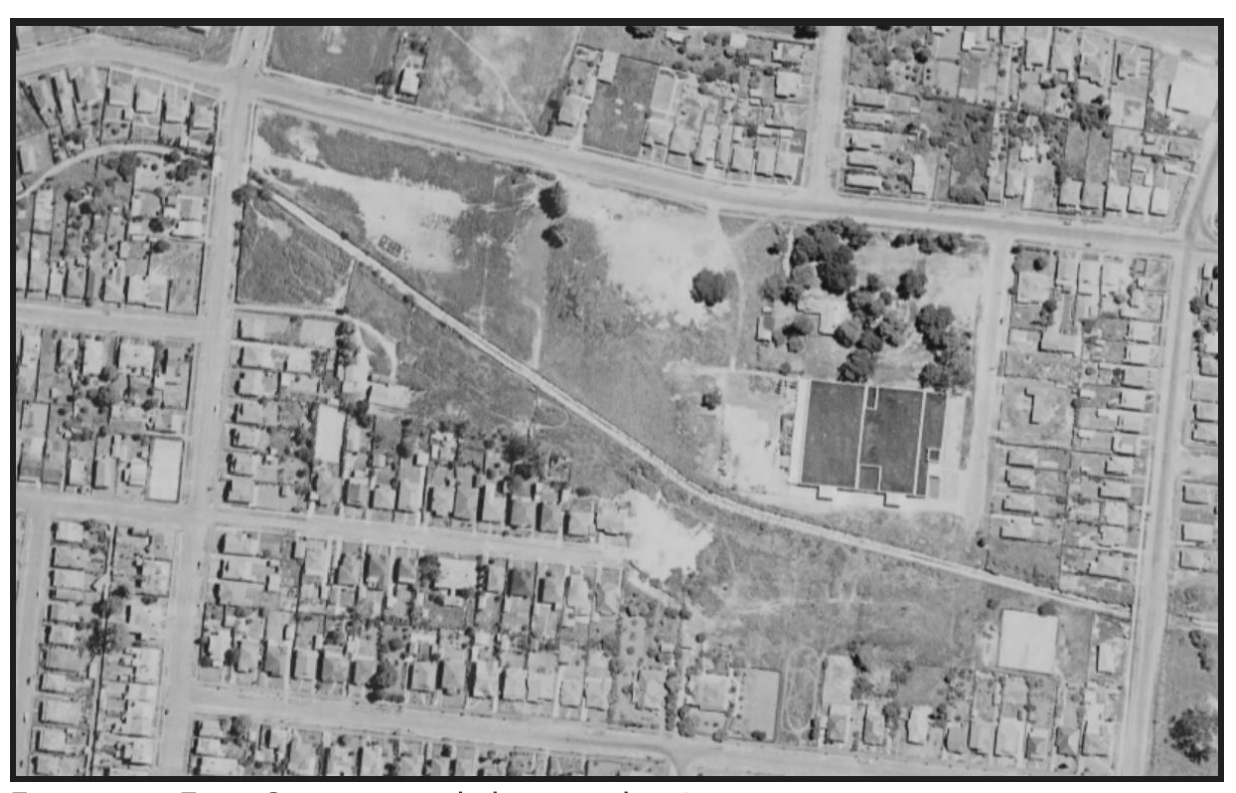
Experiment Farm Cottage aerial photography 1955.

To prevent the erosion of topsoils and the exposure of fill materials, physical barriers or 'caps' are constructed to ensure that asbestos containing materials can never come to the surface.