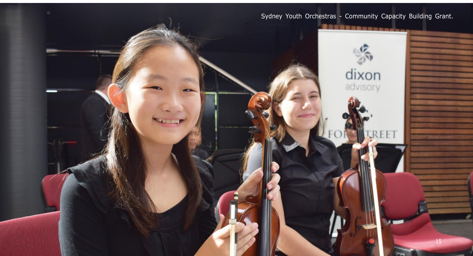
Sydney Youth Orchestras - Community Capacity Building Grant.