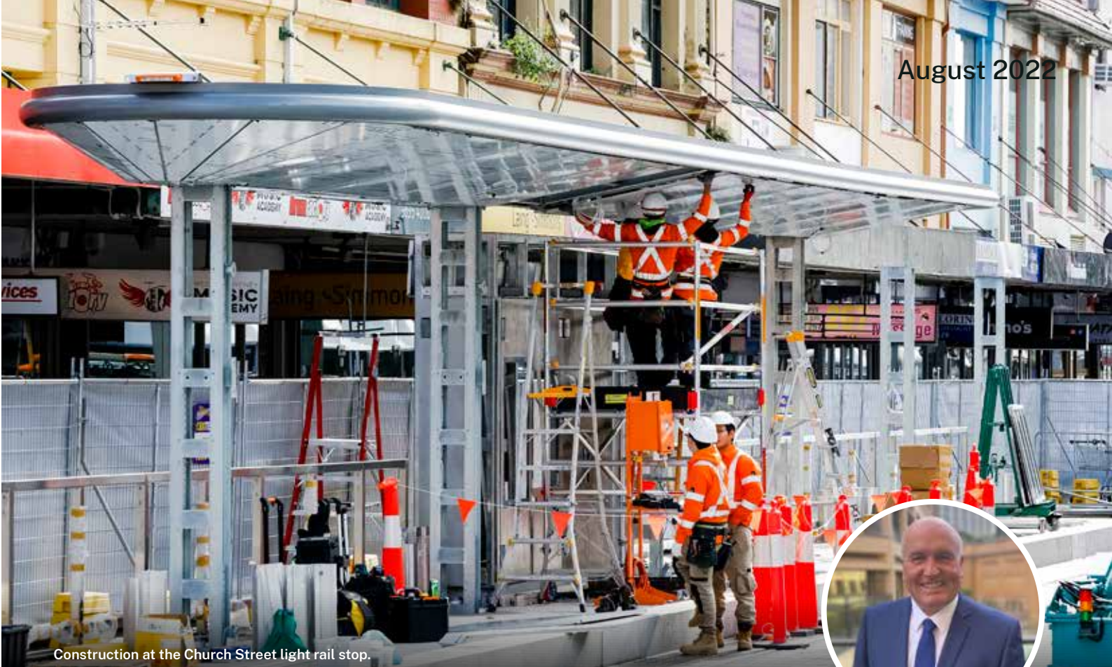
Construction at the Church Street light rail stop.