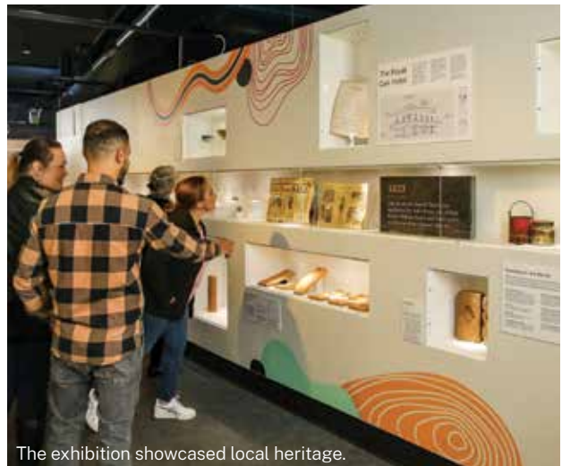
The exhibition showcased local heritage.

If you missed the exhibition, you can view the information panels on our website: parramattalightrail.nsw.gov.au/exhibition .