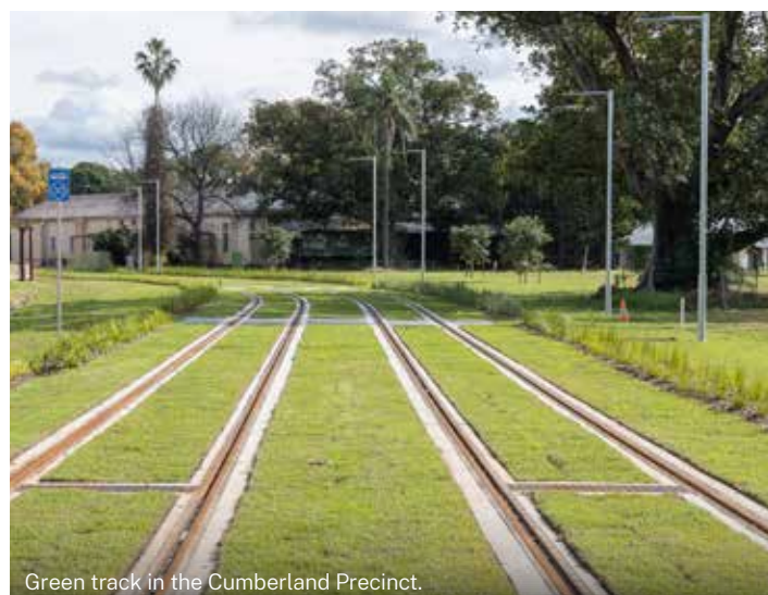
Green track in the Cumberland Precinct.

Find out more: parramattalightrail.nsw.gov.au/green-track-awarded .