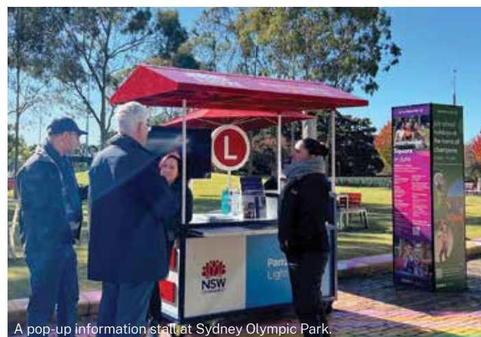
A pop-up information stall at Sydney Olympic Park.

Find out more: parramattalightrail.nsw.gov.au/parramatta-olympic-park .