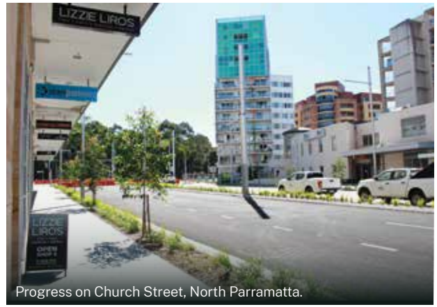
Progress on Church Street, North Parramatta.

Drivers, pedestrians and cyclists are reminded to take extra care and observe any new and changed traffic conditions. Traffic monitoring is in place to ensure ongoing traffic flow, improved access and safety.