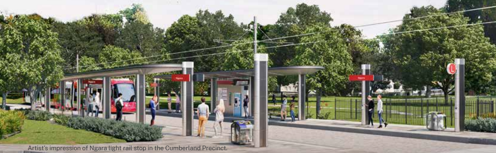
Artist's impression of Ngara light rail stop in the Cumberland Precinct.

To find out more about the stop names and naming process, visit: parramattalightrail.nsw.gov.au/stop-names-confirmed .