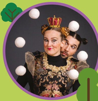
A Bee Story