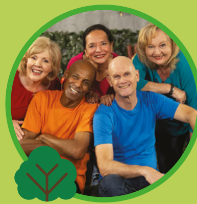
A Big Animal Adventure