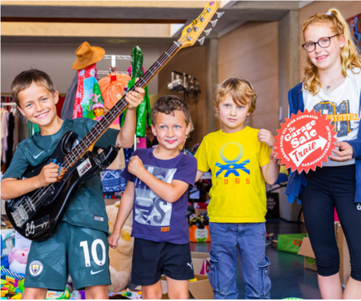
Community holding a garage sale