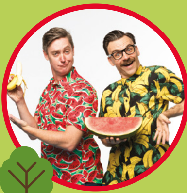
ROFL (Rolling on the Floor Laughing)