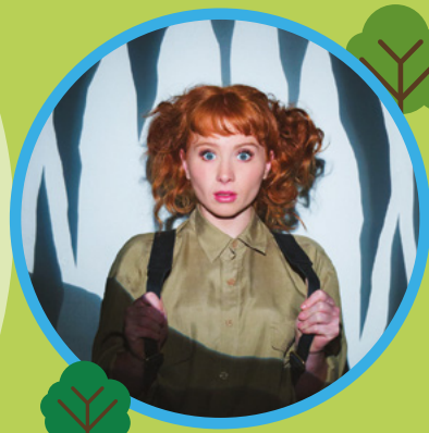
Urza and the Song in the Dark