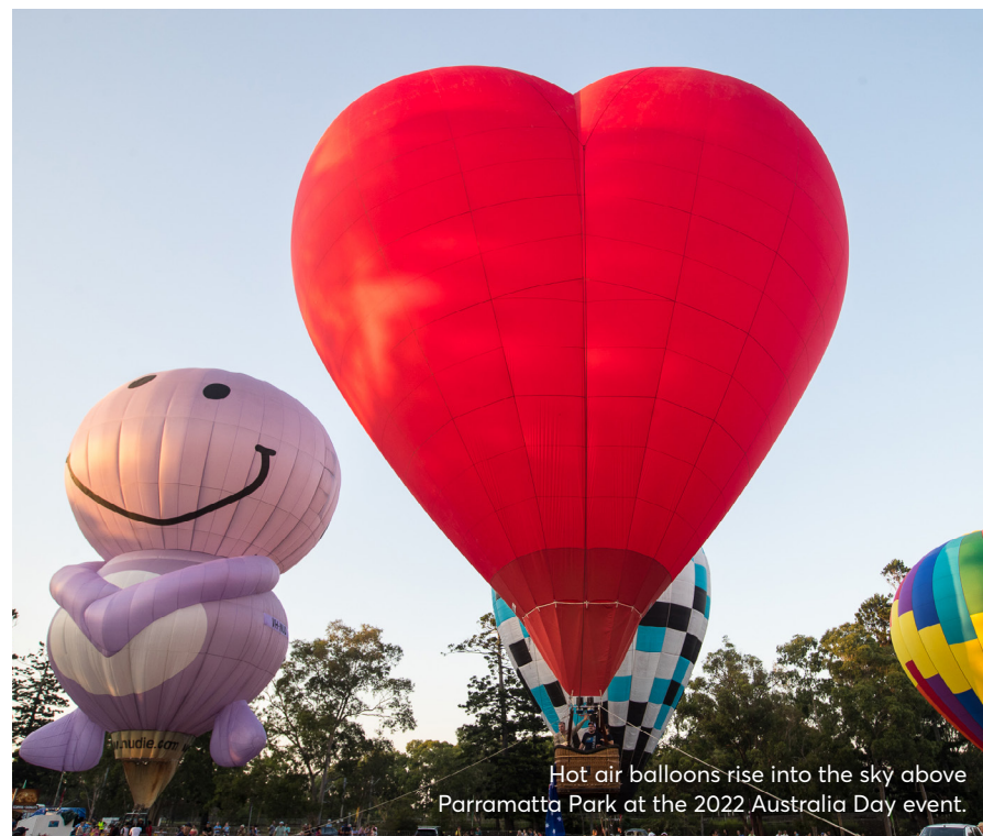
Hot air balloons rise into the sky above Parramatta Park at the 2022 Australia Day event.