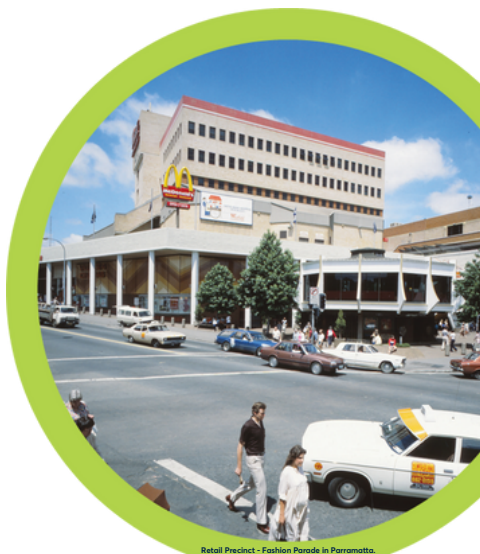
Retail Precinct - Fashion Parade in Parramatta.

Failure to acquit the grant will affect any future funding requests.