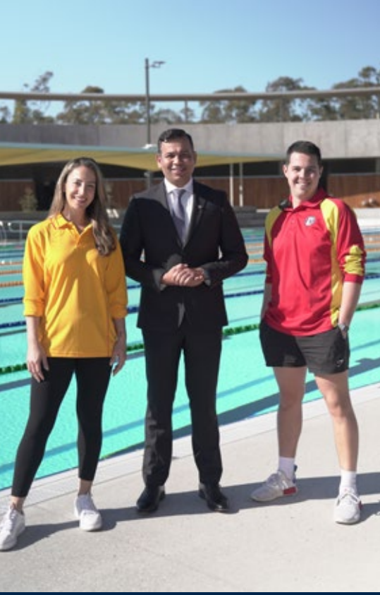
Lord Mayor Cr Pandey with staff at the new Parramatta Aquatic Centre set to open this spring.