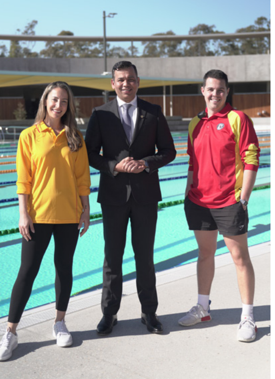
Lord Mayor Cr Pandey with staff at the new Parramatta Aquatic Centre set to open this spring.