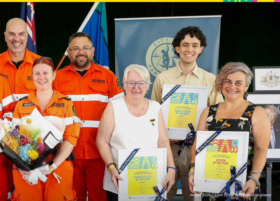
Image: 2023 Citizen of the Year Award recipients