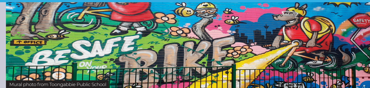
Mural photo from Toongabbie Public School

Many more historic features exist than can fit on this map. Follow the marked route and discover others, most with interesting information plaques.