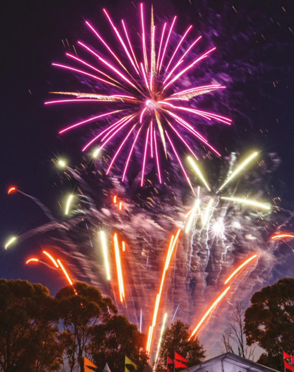
City of Parramatta New Year's Eve fireworks display