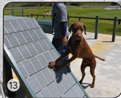
PRECEDENT IMAGES - INDICATIVE ONLY