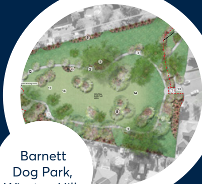
Barnett Dog Park, Winston Hills