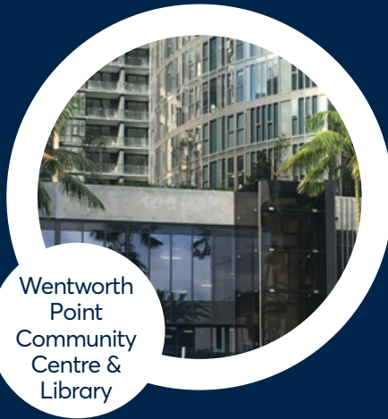
Wentworth Point Community Centre & Library

Council is continuing the implementation of the West Epping Park Masterplan with the construction of a new two-storey amenities building, featuring a change room, storage room, public toilets, community meeting room and a kiosk. Partly funded by the NSW Stronger Communities Fund Grant, it will open at the end of the year.