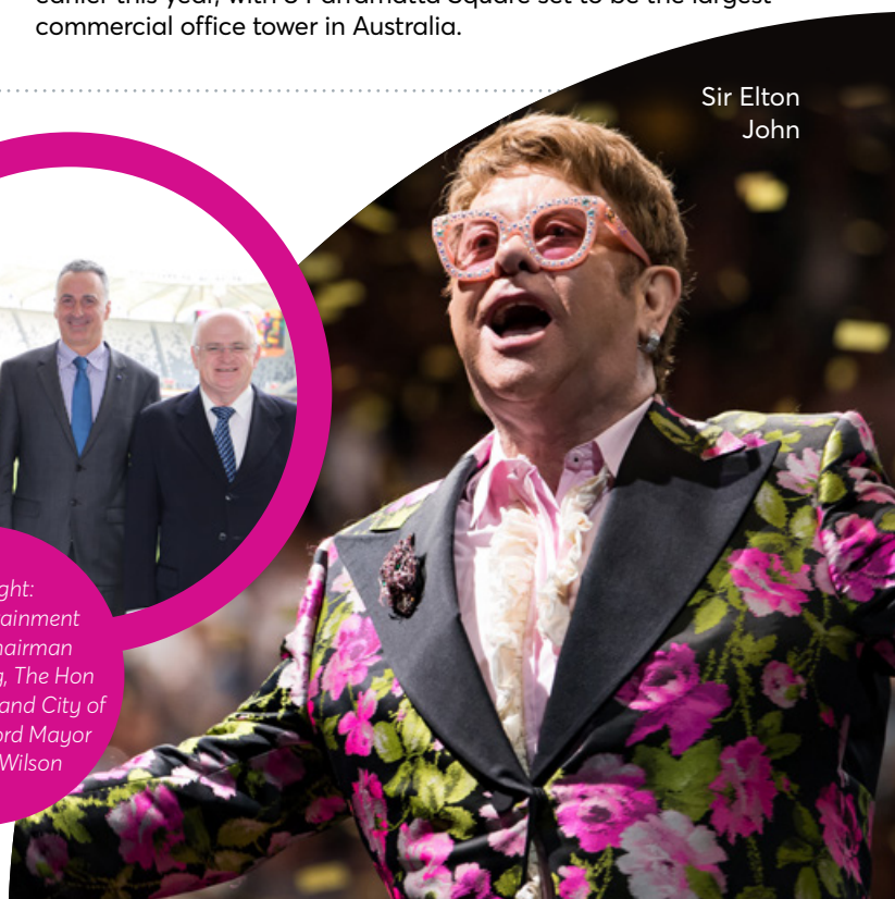
Sir Elton John