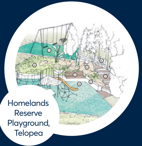
Homelands Reserve Playground, Telopea

Council received a $5 million Precinct Support Scheme grant from the NSW Government to make major upgrades to the two parks. Council is drafting concept designs based on community feedback received in May and will exhibit them for comment in November.