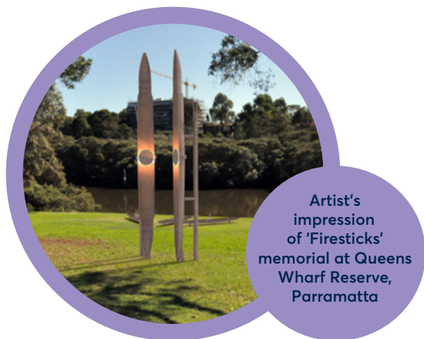
Artist's impression of 'Firesticks' memorial at Queens Wharf Reserve, Parramatta

Burramatta NAIDOC is part of the City's unique Indigenous program called Warami, a Darug word meaning "good to see you". Other Warami events included National Sorry Day, Reconciliation Week and an exciting performance by renowned Australian singer-songwriter Archie Roach in Centenary Square on Friday 31 May. For more information, visit discoverparramatta.com/events/warami