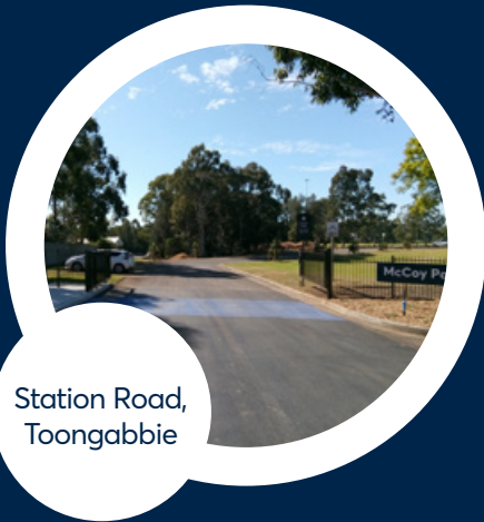
Station Road, Toongabbie