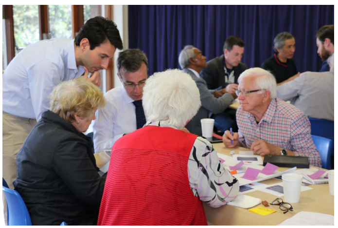
Community and stakeholder workshop session