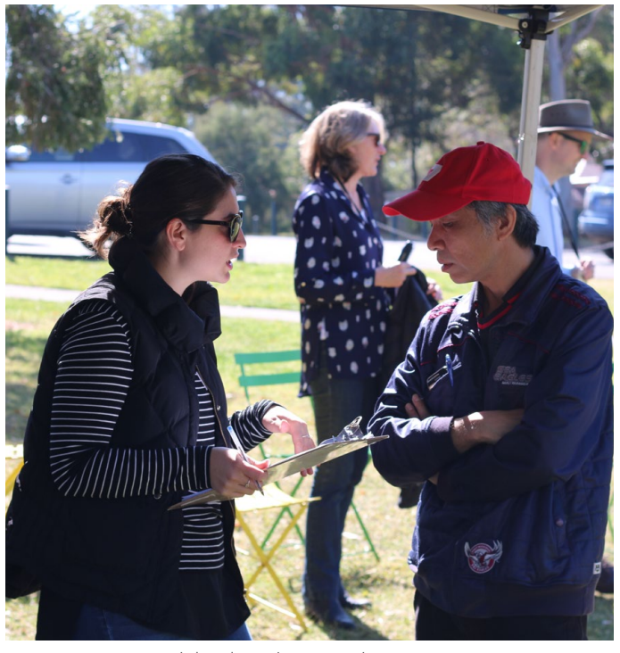
Intercept surveys with local residents in John Wearn Reserve