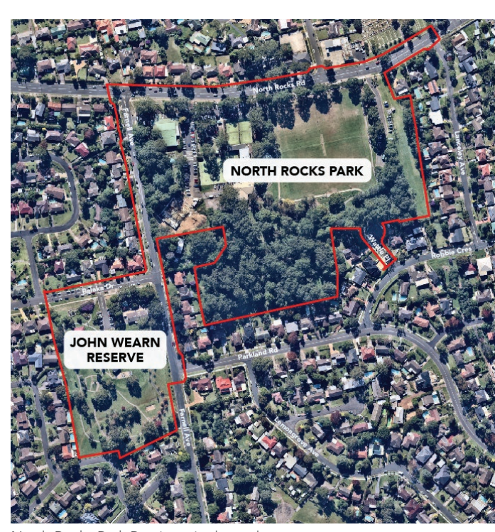
North Rocks Park Precinct site boundary

The Master Plan will review and make recommendations for improvements to community facilities; existing building use, condition and placement; parkland; sportsfields; and park amenities and recreation facilities.